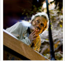
For Some Smokers, Even Home Is Off Limits

Home | World | U.S. | N.Y. / Region | Business | Technology | Science | Health | Sports | Opinion | Arts | Style | Travel | Jobs | Real Estate | Automobiles | Back to Top Copyright 2009 The New York Times Company | Privacy Policy | Terms of Service | Search | Corrections | RSS | First Look | Help | Contact Us | Work for Us | Site Map