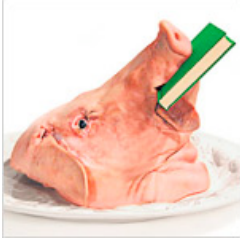
Mau-Mauing the Flesh Eaters