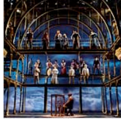
I Hear America Singing, in Syncopation