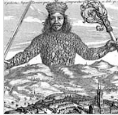
Room for Debate: Hobbes in Hebrew