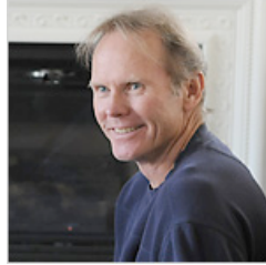
Law Seeks to Ban Misuse of Genetic Testing